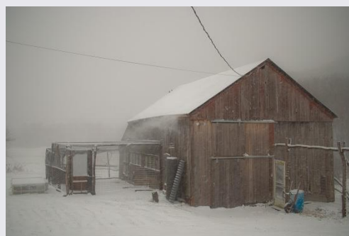
First Snow