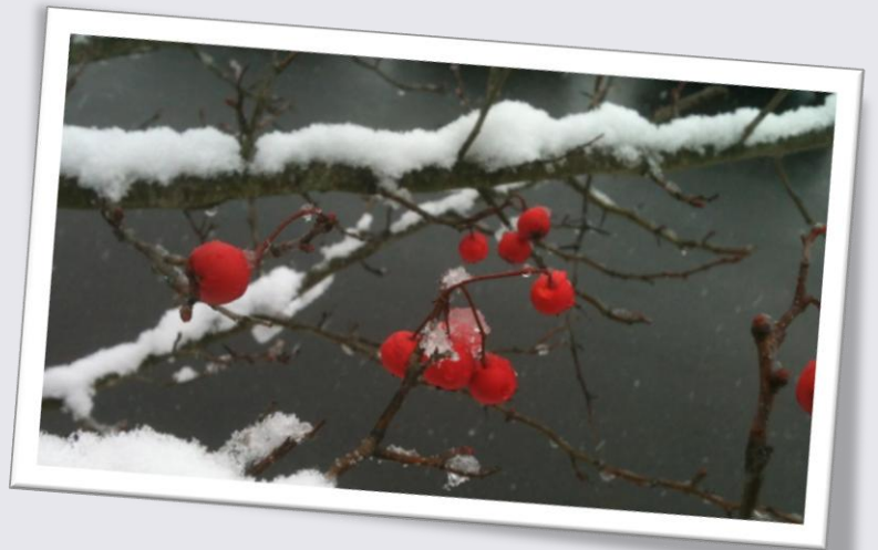
Snow Berries