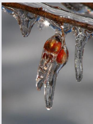
Encased in Ice

June 18: End of Year Dinner and Members Showcase.