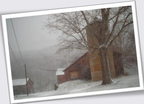
Winter Farm