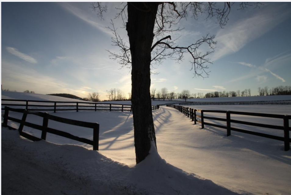
Snowy Day