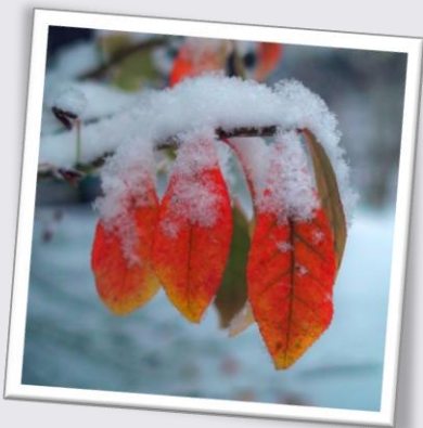
Leaves In Snow